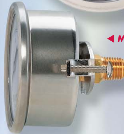
◀ MODEL 251U4